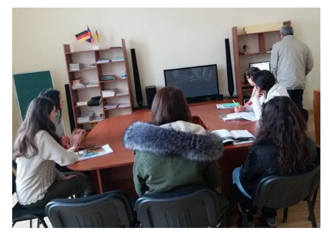
Seminar as a part of the "Supporting young people with mental disabilities" project.

Assisting teens with mental disabilities, creating safe playgrounds for children