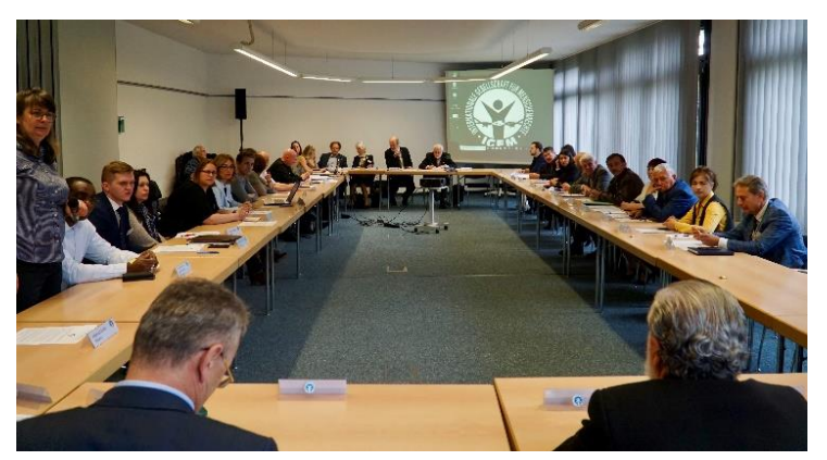
The International Council gathered for the morning session.

On April 8, 2018, the 33<sup>rd</sup> meeting of the International Council of the International Society for Human Rights (ISHR) took place at the Gustav Stresemann Institut in Bonn, Germany.