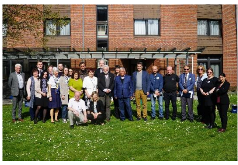
Members of the International Council of ISHR. Bonn, 2018.

Week of Solidarity with the Peoples of Non-Self-Governing Territories