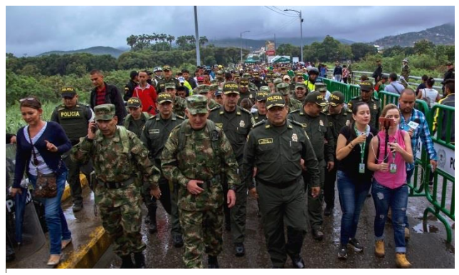
Colombian National Police leading Venezuelans across the border into Colombia. Feb. 2018.

Today in Colombia you can see many people in transit who are tired in their bodies with pain in their souls; you can see in their faces the tragedy and the burden they carry on their shoulders as they are the only hope for their families, who are imprisoned by the fear and hatred of the dictatorship. But you also see happy faces when they receive help from individuals or the Colombian state, fanning the hopeful flame of an entire Latin America that has historically been resilient and supportive. Although some requirements for income are imposed in some countries, the top levels of diplomacy can be heard designating Nicolás Maduro as an indolent