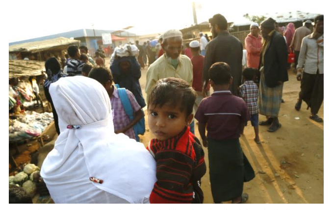
A Rohingya mother takes her child to be checked for diphtheria in the Kutupalong refugee camp in Bangladesh. Jan. 2018.

UN Reports: Military officials in Myanmar should be charged with genocide of Rohingya