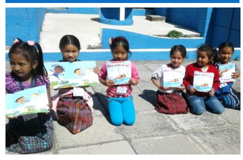
Mayan girls hold up their school books delivered by ISHR Guatemala