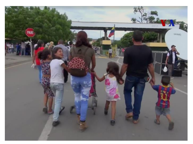
Venezuelan family entering Colombia after emigrating from their native country. June 2018.

'Without Borders': On the Venezuelan refugee crisis, the largest in the history of Latin America