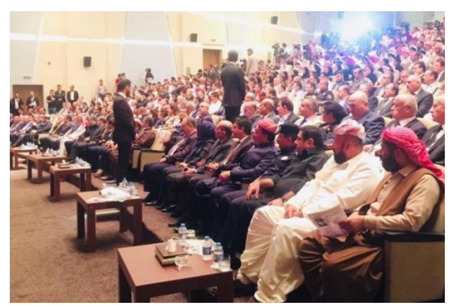
ISHR Iraq attended the commemoration events of the 4^{th} anniversary of the IS attack on Shingal. Aug. 3, 2018.

Activity report: Addressing crimes of ISIS, seeking accountability for Yazidi genocide