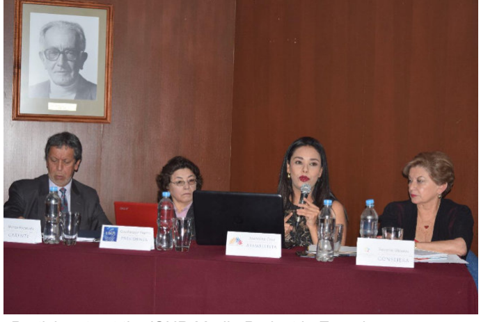
Participants at the ISHR Media Project in Ecuador

During this reform phase, the ISHR 2018/2019, together with Fundamedios and with the support of the German Federal Ministry for Economic Cooperation and