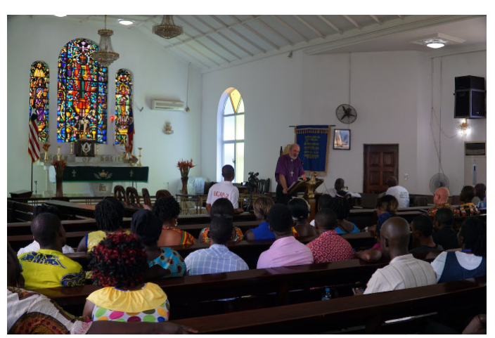
Both photos: Prof. Dr. Schirrmacher in Liberia © BQ/Warnecke

Schirrmacher argued that while Christians are convinced that the causes of many of the problems identified by the SDGs, such as racism and corruption, are much deeper, this does not change the fact that the goals themselves are to be welcomed by Christians and all men of goodwill. He made the case that that racism, corruption, discrimination or contempt for women, for example, cannot only be overcome by external factors, but that profound conversion of the whole a personality is decisive for it. But the state