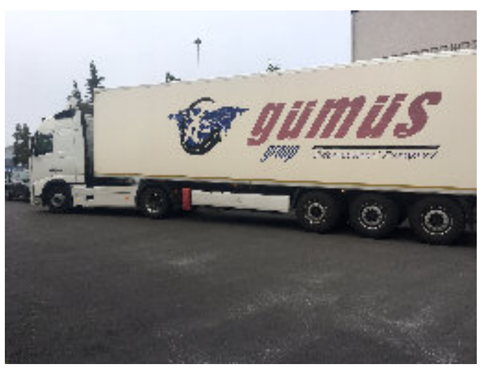
470th and 16th Relief Transport to Northern Iraq