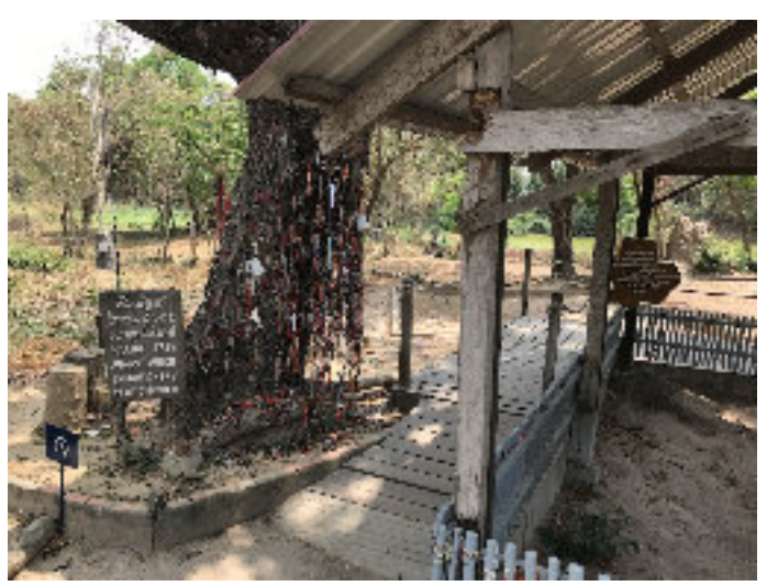
The tree in Choeung Ek, where the skulls of the children were smashed

Particularly notorious was the torture centre for important persons in Phnom Phen in the former school 'Tuol Sleng,' code name S-21, although we know today that there were