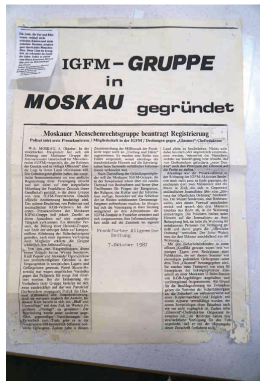
Original article from the Frankfurter Allgemeine Zeitung of 7 October 1987, which read in large letters: “ISHR working group founded in Moscow”