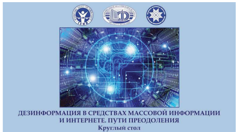
Invitation to the event in Belarus

“Media, opinion making, human rights in the countries of the Eastern Partnership and Russia”, the one-year project, ended on 6–7 December 2019 with a conference in Frankfurt am Main where the headquarter of the International Society for Human Rights/ISHR is located. The representatives of the participating countries Armenia, Azerbaijan, Belarus, Georgia, Moldova, Ukraine and Russia came to the conclusion that social networks are playing an increasingly important role in the acquisition of information, thereby replacing the print media and used more than ever by governments as well as for the manipulation of opinions and targeted disinformation. In countries where the media are in the hands of governments or oligarchs, they pose an immediate threat to freedom of expression, democracy and the rule of law.