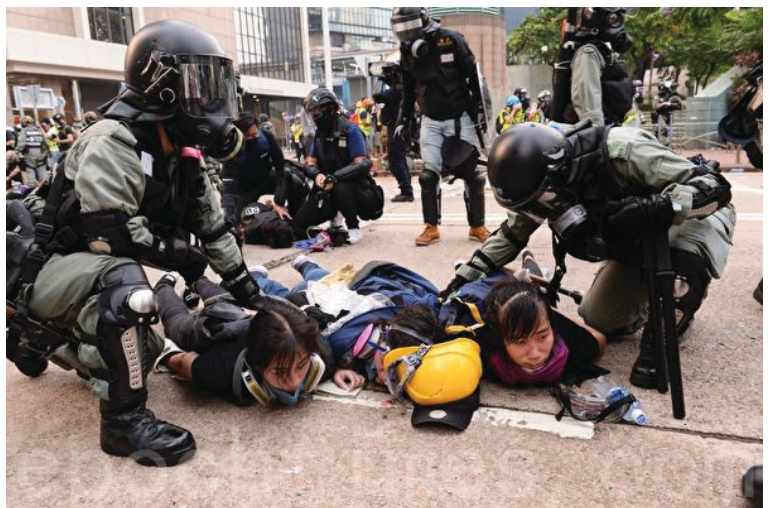
Police brutality against protesters.

The majority of the people of Hong Kong insist that all of the five demands must be met. The people of Hong Kong are fighting for their basic human rights and fundamental freedoms. It is my humble opinion that the German government should take a clear stand in support of the people of Hong Kong; not just the moral equivocations resident in such slogans like: “we ask both sides to eschew violence”.