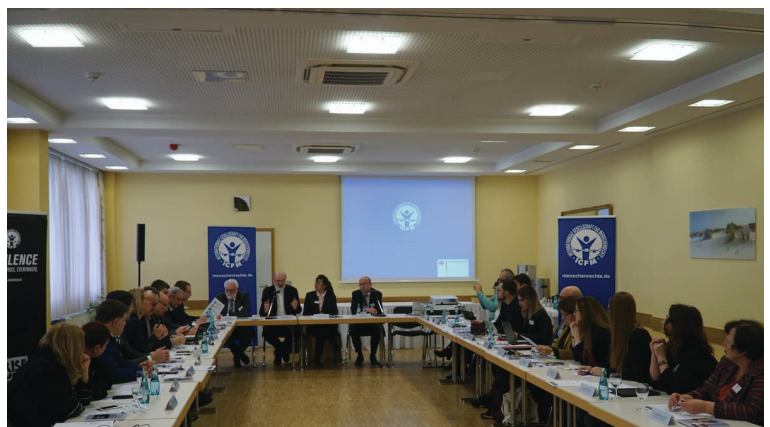
14 representatives from all countries of the Eastern Partnership/EaP and Russia at the conference table with Frankfurt politicians, as well as RWB, rferl, PRIF and of course ISHR

The smartphone has long determined the street scene in Eastern Europe, and some large cities are bursting with Internet modernity and can withstand comparisons with Western IT standards at any time. At first glance, this seems to be a contrast between modern freedom and old borders. However, the coverage of numerous political affairs makes it clear to everyone that the Internet is not only a medium of global freedom, but also a specialized means to influence masses of people. Fake news is not an invention of Western media, but rather in the countries of the Eastern Partnership and Russia's everyday IT life, to which their citizens are exposed on a daily basis.