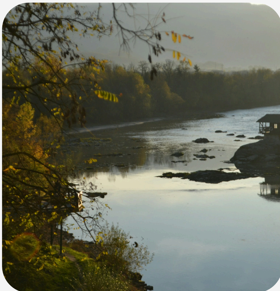
The beautiful Drina river valley near Višesava.