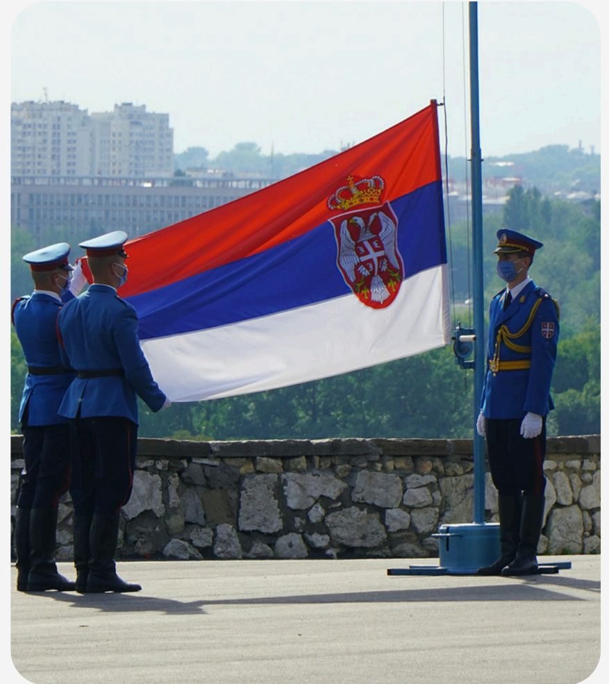
Serbian soldiers raising the national flag at a ceremonial event, with the cityscape of Belgrade in the background.

The Jadar Lithium Project, a multibillion-euro mining venture backed by Rio Tinto, is projected to become one of Europe's largest lithium extraction sites. While promoted as a gateway to green energy, its development has instead highlighted serious breaches of environmental law, civic rights, and democratic norms in Serbia. The government's approval process bypassed key safeguards under the Aarhus Convention, denying affected communities access to environmental information and participation in decision-making. Widespread protests were met with repression, media censorship, and legal harassment. Investigative journalists and environmental defenders faced Strategic Lawsuits Against Public Participation (SLAPP), while infrastructure failures like the Novi Sad train station collapse exposed systemic corruption. This briefing examines the Jadar case not as an isolated dispute, but as a reflection of Serbia's shrinking democratic space and eroding rule of law, calling for urgent accountability from both domestic institutions and international partners, especially within the context of Serbia's EU accession process.